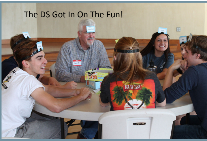
The DS Got In On The Fun!